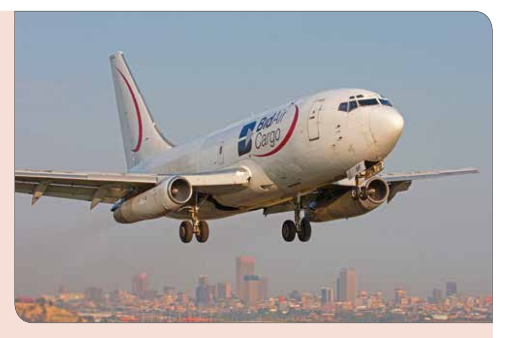
Cargo Africa, BidAir Cargo is now ready to showcase our services to the world. We look forward to great interest from major airlines who require cargo management services in South and Eastern Africa.

Over 200 companies from more than 40 countries are expected to attract more than 50 000 visitors from 110 countries. Sharing the South African stand and flying the flag along with BidAir Cargo will be Airports Company South Africa (ACSA) with whom we enjoy a close working relationship and Africa Flight Services.