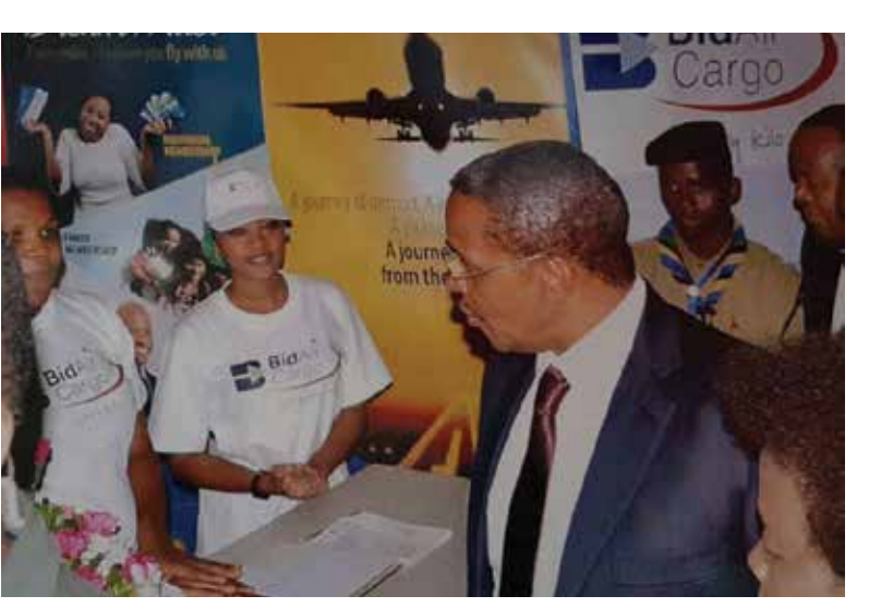
Tanzanian President Jakaya Kikwete visiting the BidAir Cargo Stand during the 39th Dar-es-Salaam International Trade Fair (SabaSaba).