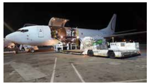
Off-loading incoming cargo